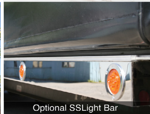
Optional SSLight Bar

Life Time Warranty: Extruded Frames / S.S. Track / Metal Wheels