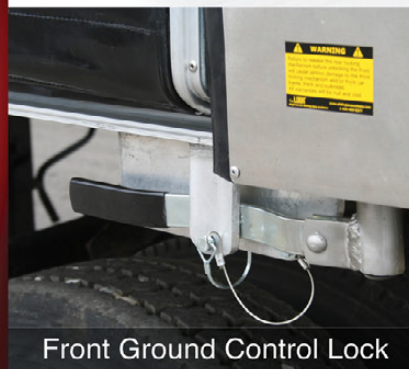
Front Ground Control Lock