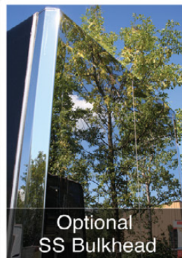
Optional SS Bulkhead