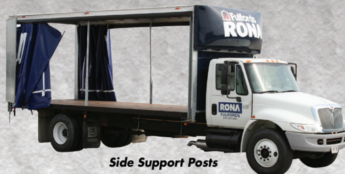
Side Support Posts