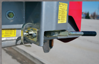
Front Ratchet Tensioner