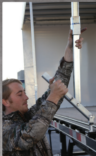
Removable Breakaway Posts