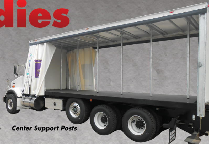
Center Support Posts

ALCS side curtains for truck bodies makes scheduling of local deliveries easier than if delivered in a regular hard side van body. No longer is the first loaded goods, the last goods delivered. With a side curtain system shippers can organize versatility in their deliveries with the ease of unloading from any position on the deck of the truck body. Available with center support posts dividing the deck into two halves or side break away post allowing full interior loading like a van an ALCS side curtain system will suit your load covering needs.