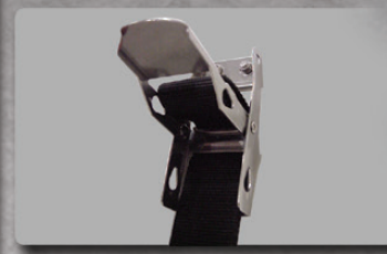
Stainless Over Center Buckle