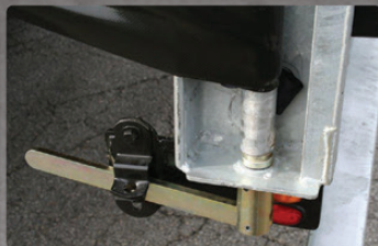
Rear Curtain Quick Release