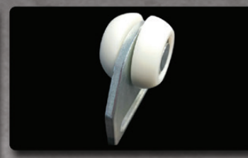
Tapered Ball Bearing Rollers