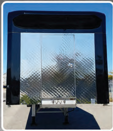
Waffle Mirror Stainless - Opt.

All LCS Bulkheads are tested in comparison to a 100" High Flat Aluminum Front Wall at 65MPH