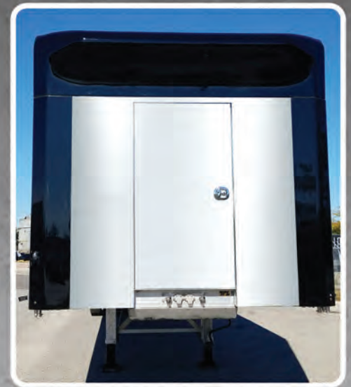
Nickel Bright Aluminum - STD.

LCS - Load Covering Solutions offers the 1st ever Fully Integrated Aerodynamic Flat Front Modular Bulkhead. Our Engineering Design Criteria was very specific. Provide a minimum Wind Drag Reduction of 5% or better, Improved Fuel Economy of 2.5% or better, Easy to Replace Components for Service & Repairs, Multiple Front Wall Panel Choices and an overall "GR8LOOK" appearance. Our CFD tested 10" fiberglass upper nose fairing and dual contoured fiberglass side panels can all be color coordinated to match your choice of tarp color. Make the Windmaster GR8LOOK Rolling Tarp System your next choice!