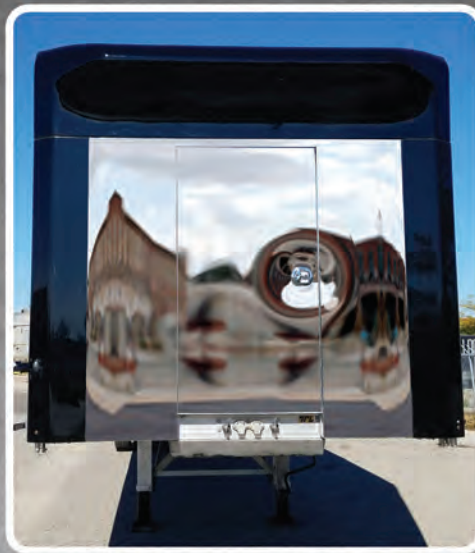
Smooth Mirror Stainless - Opt.